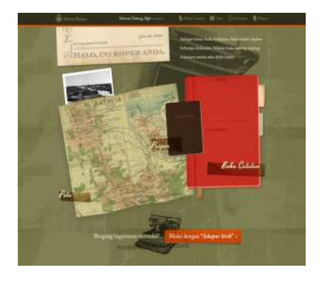
Figure 2. Private area interface, main menu