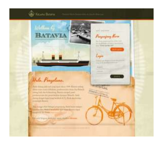
Figure 1. Public area interface

Interface iterations have been done for the desktop and mobile web versions. There is also an information architecture scheme to complement the mockups.