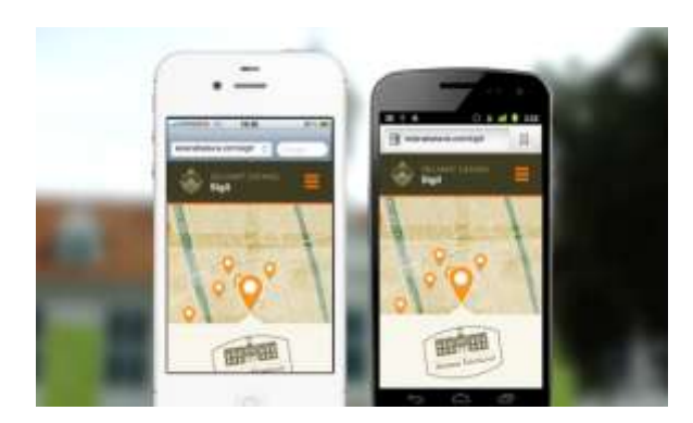
Figure 3. Mobile web version

Contents are still in dummy format because they need further development by content specialists.